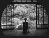
stanford cheung/scarborough - editor