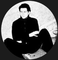
marc di saverio/hamilton - editor